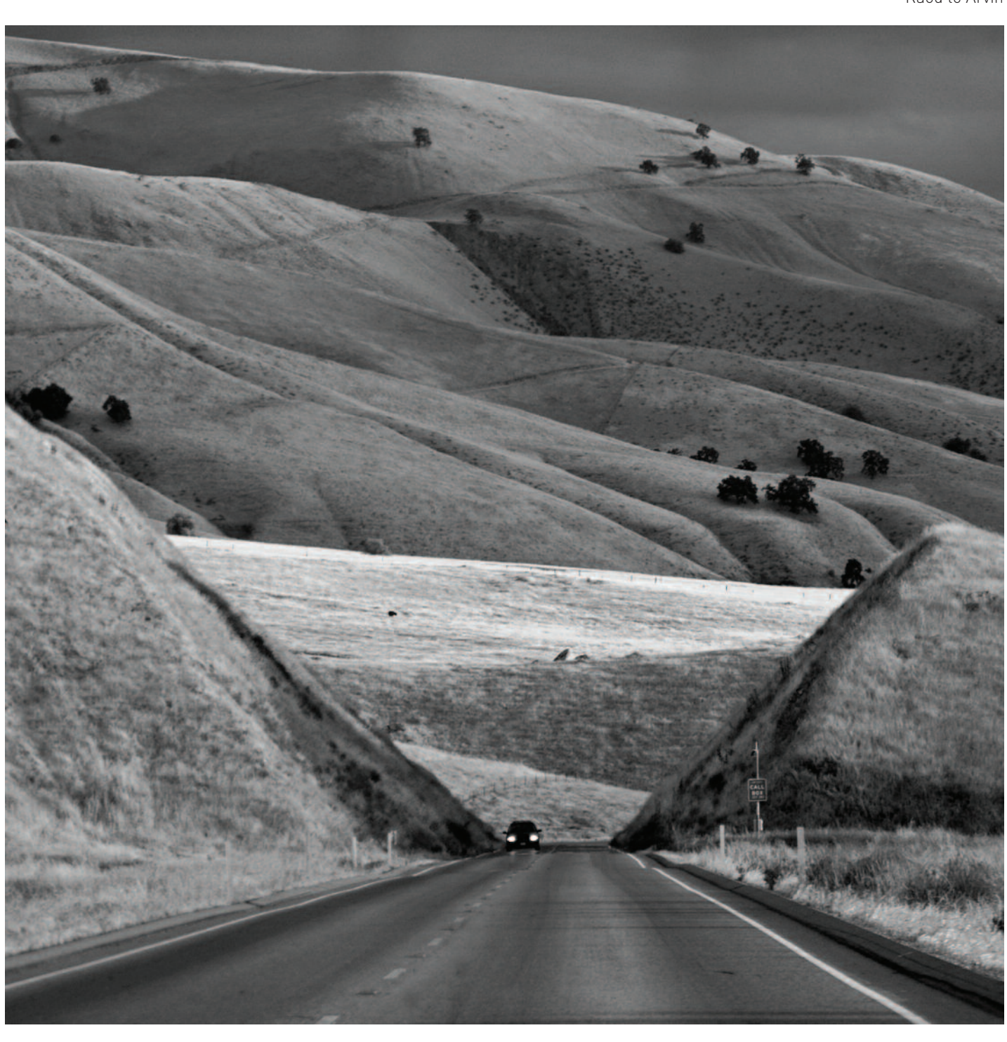
Raod to Arvin